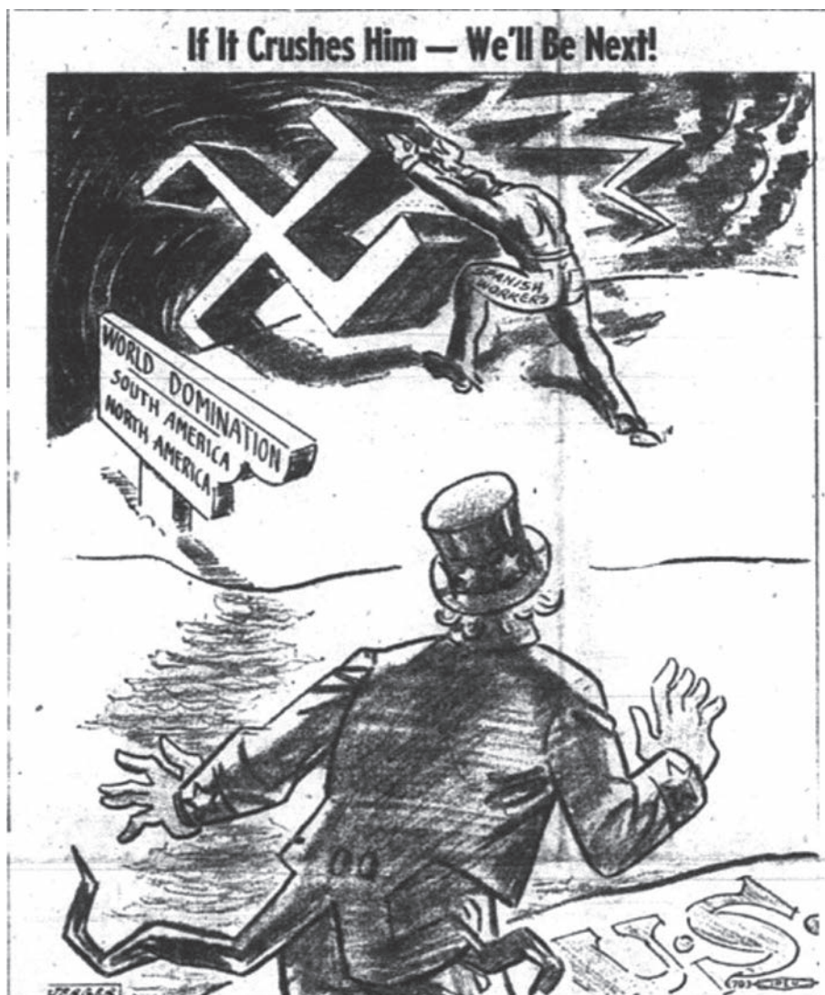
An American cartoon published in 1938.

An American journalist broadcasting from Madrid to the USA, October 1938.