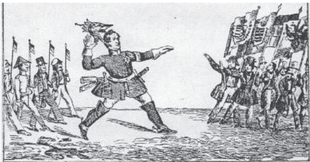
A cartoon published in Germany, March 1848. King Frederick William IV is saying to the revolutionaries, 'You up ahead! Hurry to me because I want to lead the movement.'