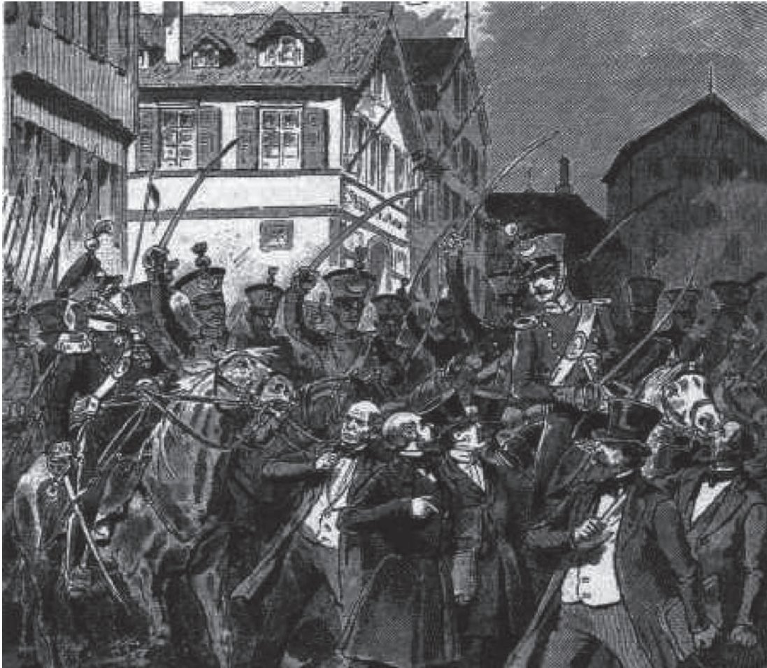
A drawing, from the time, of the Württemberg army and the last members of the Frankfurt Parliament in Stuttgart in June 1849.