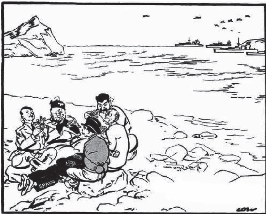
A British cartoon published in January 1937. On the left are Hitler, Mussolini, Stalin, Blum and Eden (a leading member of the British government) playing cards. 'Trustful Tony' (Eden) is saying, 'Just to discourage cheating, I'll wear a strait-jacket and let you chaps play my cards.' In the top left is the rock of Gibraltar.